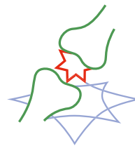
ORTHOPEDECS/ PAIN MEDICINE/ RHEUMATOLOGY