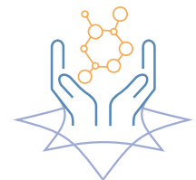
HEALTHY AGING AND REGENERATIVE MEDICINE