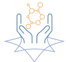
HEALTHY AGING AND REGENERATIVE MEDICINE