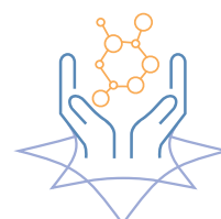
HEALTHY AGING/ REGENERATIVE MEDICINE